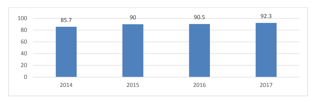
FIGURE 1 PERCENTAGE OF ECONOMIC EXPERTISE APPOINTMENT

The PwC's 2014 Global Economic Crime Survey, which was based on the responses of over 5,000 respondents, stated that accounting fraud had always been one of the major crimes reported in their surveys. In 2014 22% of respondents reported experiencing accounting fraud (Zagera et al., 2016).